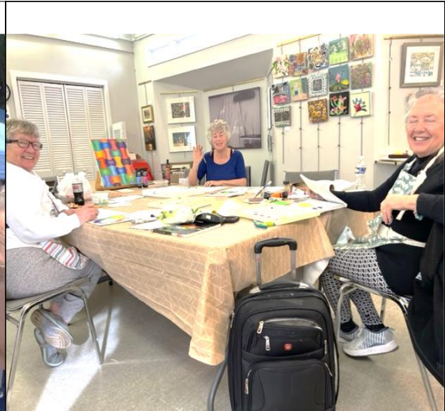
Art Classes and Show at the KIFA Gift and Art Gallery

So much to enjoy! Scroll through the listings for your next adventure!