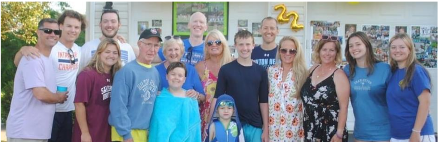
The Whole Family — May 30, 2022