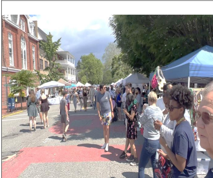
Chestertown Market Saturdays 1 – 5 p.m.