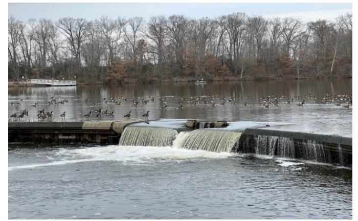
On the way to Adkins Arboretum through Tuckahoe State Park.