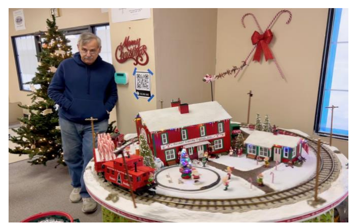
The train travels on an incline spinning the turntable in the opposite direction. This was taken at the Holiday Train Show on Kent Island.