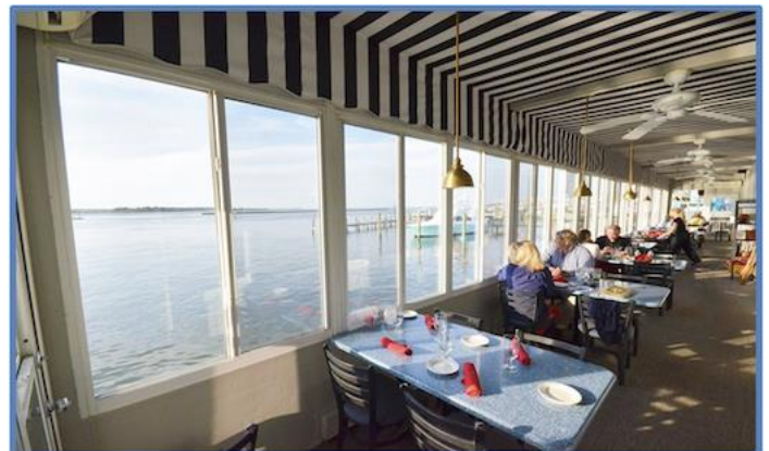
Waterfront Dining at the Narrows

The next Lunch Bunch is scheduled for Thursday, December 1, at 12:30 p.m. at the newly renovated Narrows Restaurant located on the water at 3023 Kent Narrow Way S in Grasonville. The beautiful waterfront spot provides stunning sunsets while dining. The Narrows is known for its crab cakes and an award-winning cuisine. We look forward to a crisp December day and an opportunity to lunch with our SV friends. For additional information and to view the lunch menu, go to https://thenarrowsrestaurant.com .