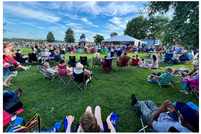
Baltimore Symphony Orchestra at the Wilmer Park

Centreville Farmers' Market: Sundays 9 a.m. – 1 p.m., rain or shine, Lawyer's Row, through October 9.