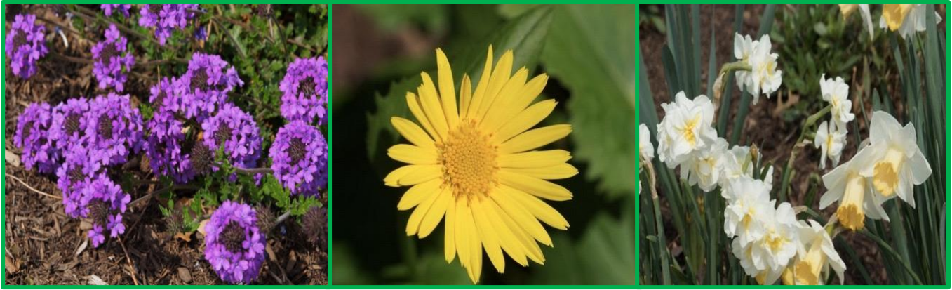
Enjoy the different seasons.