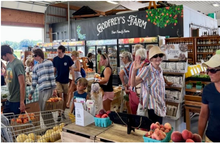
Godfrey's Farm open through Labor Day