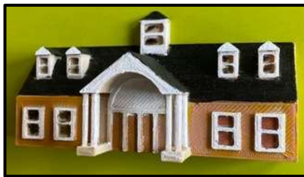
Model of Symphony Village Clubhouse