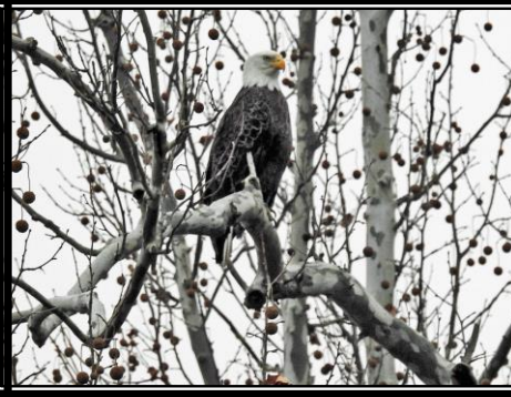
Symphony Village Wildlife