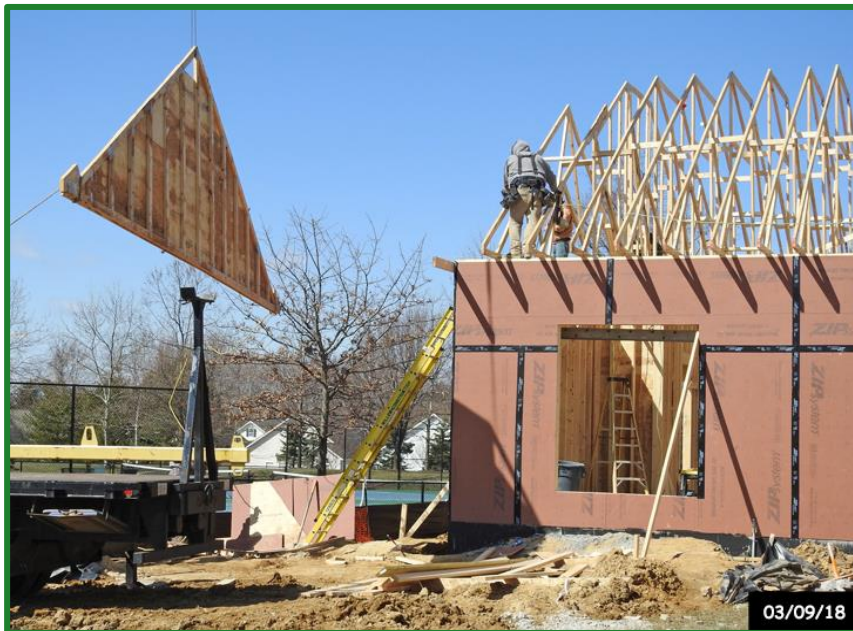
Project is topped out as the last truss is lifted into place