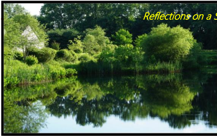
Reflections on a Symphony Village Pond