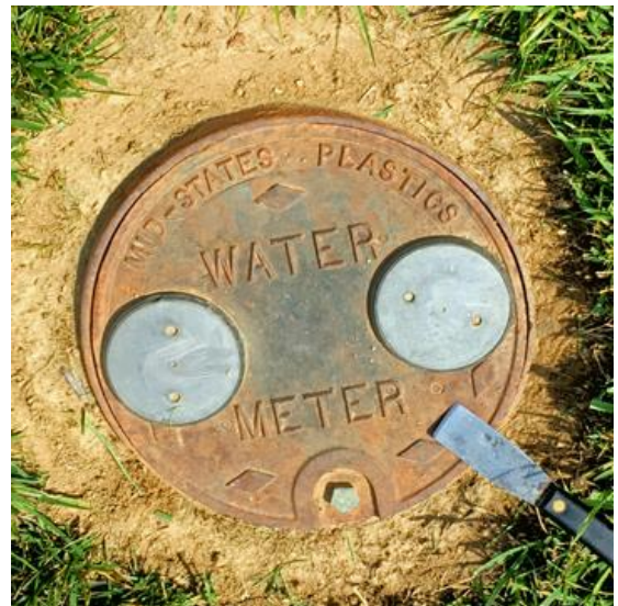
Water shutoff/meter access cleaned up with a putty knife (or pull the grass out barehanded!).