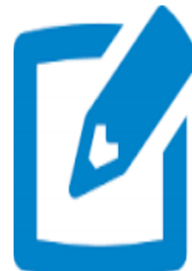
CLICK ON LUNCH BUNCH ICON TO SIGN-UP