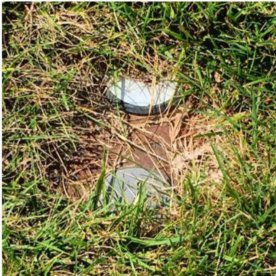
Water shutoff/meter access grown over

Is your water shutoff/meter access grown over with grass? If so, you should trim around the access so that the water supply could be located and shut off if there is a water leak between the access (town water supply) and your house. Generally, there is a water shutoff access between each two homes; look for it between the curb and the sidewalk. (NOTE: This procedure has been added to the CERT SV Homeowners Fire, General Safety, and Hints section of the SV Homepage (Index, CERT)).