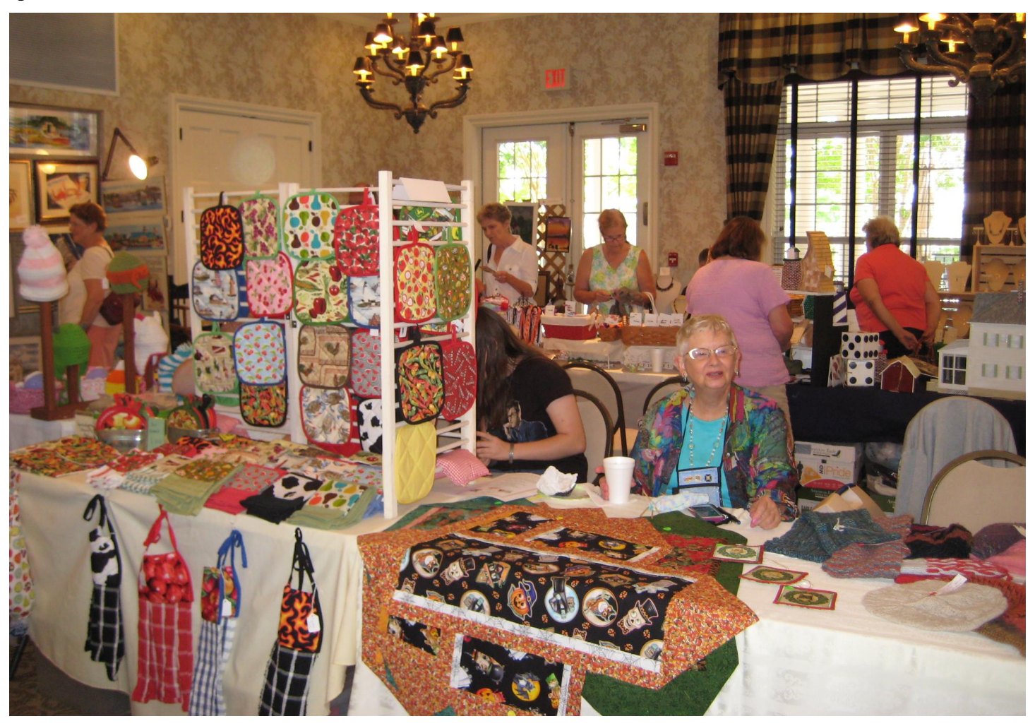
If you have a craft that you are passionate about and "inventory" to sell...we want you!

quilting; a variety of other crafts including knitted hats, sweaters, original hair ribbons and accessories; wood works (including bowls, ornaments, and pens); jewelry of many materials; holiday fare; household and outdoor specialties; and much more.