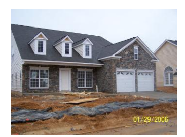
141 Encore Court

Of course we all know that Symphony Village used to be nothing but fields, but it is hard to imagine. Therefore, could you send